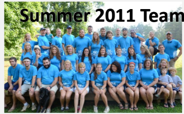
Summer 2011 Team

Summer Staff From: Liberty University, UNC Wilmington, North Greenville Univ., Forsyth Tech, Piedmont Bap. College, and UNC-Greensboro