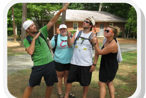
Winston-Salem, North Carolina Area